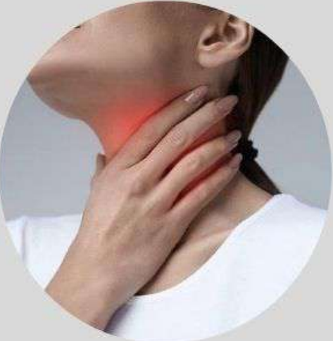
Reduces Throat Infection