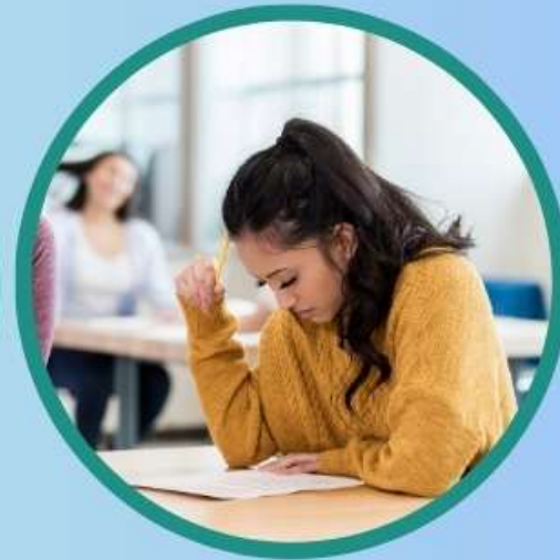
Focus and Concentration