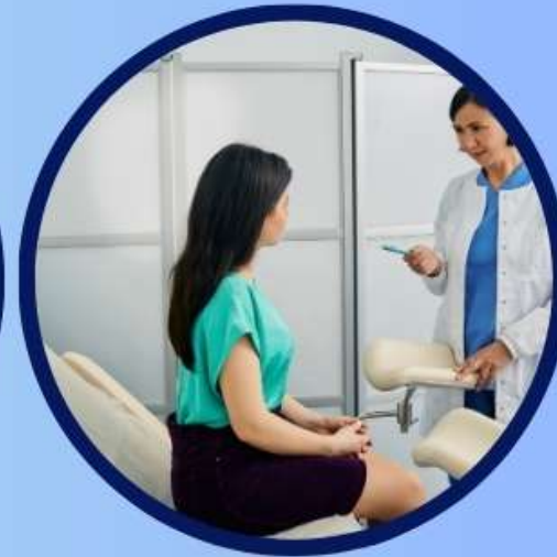
Maintains Reproductive Health