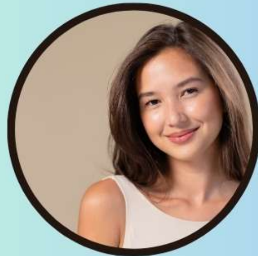
Maintains A Healthy Skin